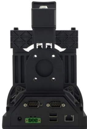
Picture of the old dock